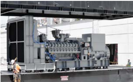
One of six MTU Onsite Energy 3,000 kW generator sets that supply emergency standby power to building V2, this unit is being installed in a weather-tight enclosure located outside the data facility.

Uptime Institute (a third-party organization focused on improving data center performance and efficiency), typical data centers have average PUEs above 1.9, and some even have a rating as high as PUE 3.0 – meaning that two-thirds of a facility's power consumption would be used for cooling and only one-third for the IT equipment. In addition, finding operational efficiencies has significant implications for sizing of the emergency standby power system: The lower the overall energy needs are, the more redundancy you can afford to build into your emergency standby power system. The result is much higher redundancy and reliability for no more investment – a critical factor for data centers that need to maintain near-100 percent uptime.