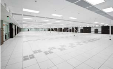
A photo of an empty server floor at one of Vantage's Santa Clara data center buildings, taken soon after construction and before tenant move-in.